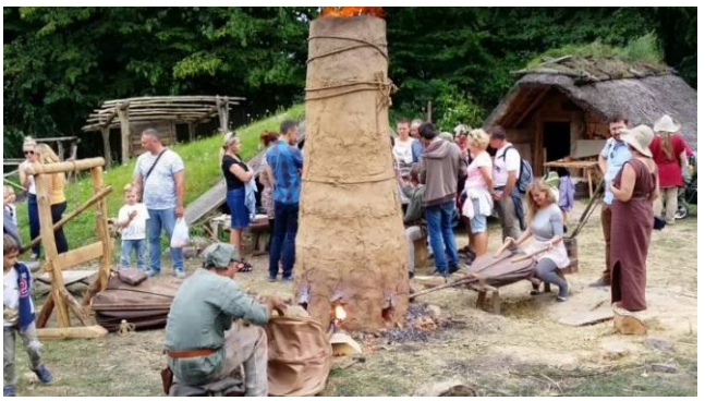
Nowa Słupia (Metallurgy in the Roman period)

Suchedniów – Nowa Słupia (Metallurgy in the Roman period) – Krzemionki Opatowskie (Neolithic flint mines) – Suchedniów