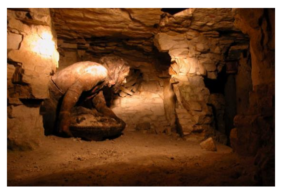
Krzemionki Opatowskie (Neolithic flint mines) krzemionki.pl